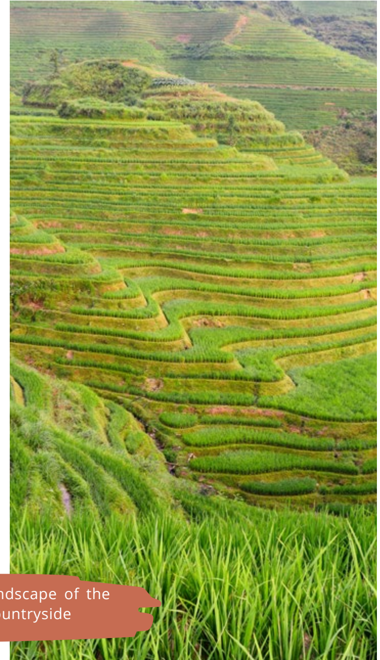
The dazzling landscape of the Guangxi countryside